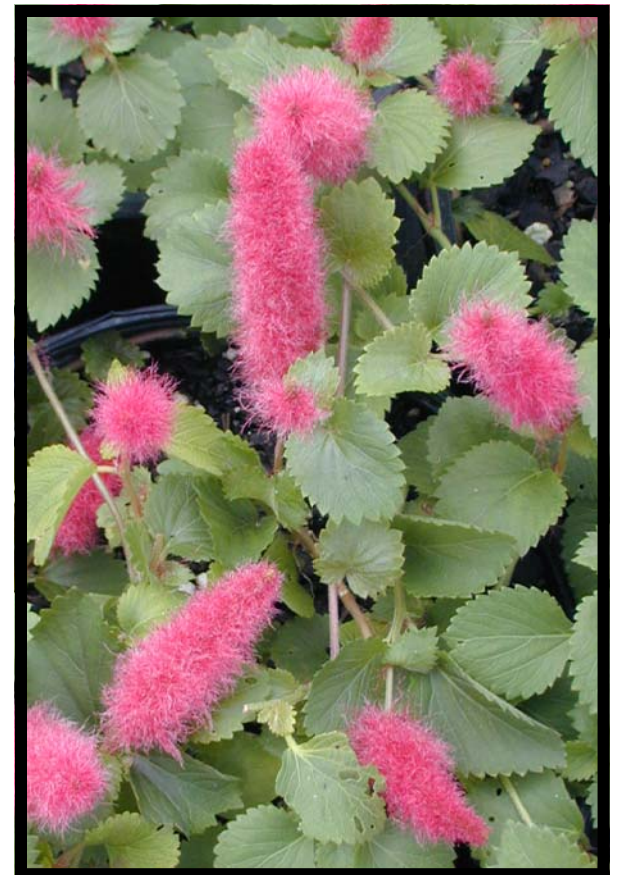
Firetail Chenille Acalypha pendula

An unusual & attractive groundcover for part shade that slowly carpets the ground & is covered with long 3''-6'' crimson flowers tassels spring to fall. Evergreen in most Houston winters. Part shade. Moist, well drained soil.